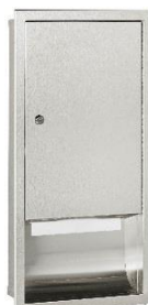
DTE0040CS Satin finish