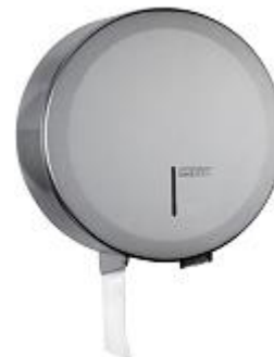
PR2789CS Satin finish