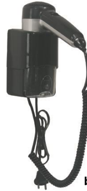
SC0030CS black finish