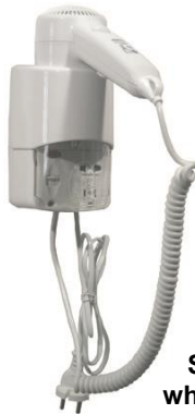
SC0030 white finish